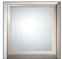
Glass Panels - transmit light and provide an airy feeling while creating visual boundaries in a space.