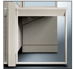
Open Leg - makes a bold visual statement in a minimal footprint when supporting a worksurface.

With the Legion panel system, we give you a diverse group of specialized components ready for the field. All that's left to decide is where you want them to take you first.