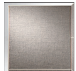
Fabric Panels - offer privacy and acoustic dampening to improve concentration in collaborative spaces.