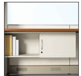
Overhead or Underhead Storage - is provided by U-Series cabinets with their unique sliding door.