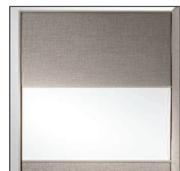
Markerboard Panels - are made of steel, making them compatible with both magnets and markers.