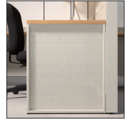
Perforated Insert - give worksurface-supporting legs a uniform look and help users maintain their modesty.

In individual stations, storage space is often at a premium. Legion helps maximize it by integrating seamlessly with U-Series, Venus, and Universal overhead cabinets. Exemplifying the furniture's openness and minimalism, U-Series cabinets offer a unique sliding-door design that provides access to materials without encroaching on the user's space. The sliding doors also make U-Series storage ideal for applications beneath the worksurface like credenzas and underheads.