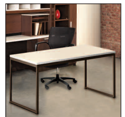
Freestanding Table - translates the line's open leg and slim profile into an eye-catching centerpiece for consultations.