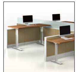
Panel Wrapped Tables - give users the best of both worlds—privacy and height-adjustable surfaces.