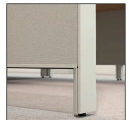
Raised Panel Leg - set Legion Panel Systems apart by improving air circulation in the workspace.