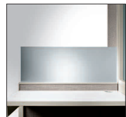
Glass Dividers - can be used at worksurface or standing height to let in natural light while defining spaces.