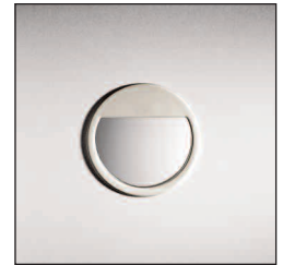
Legion Grommet - allows electrical and data/communications cables to pass neatly through the worksurface.

Legion's stacking markerboard, fabric, and glass panels also improve the system's long-term flexibility and utility. They can be used with existing panels during reconfigurations to prevent waste and reduce costs, or to tweak recently-completed designs when clients' needs change.