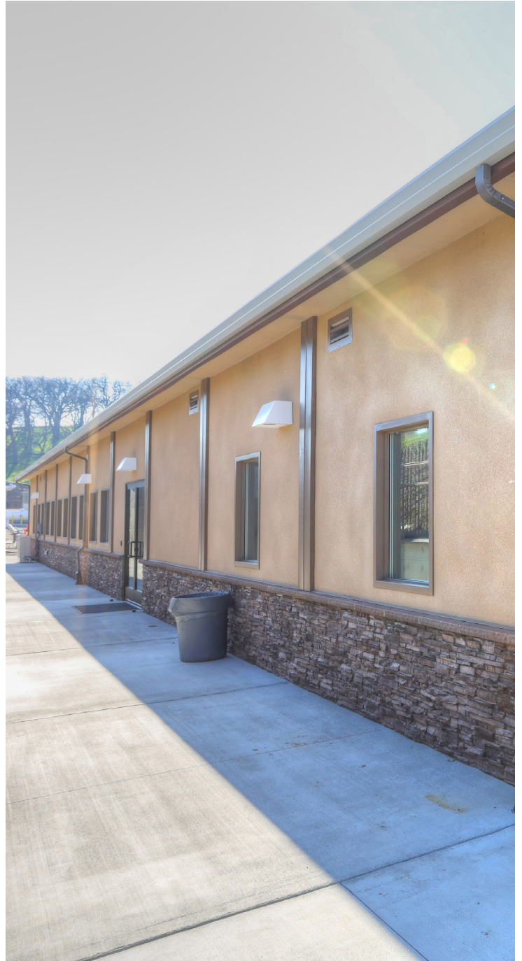
The MIS modular building at CALPIA's central office

The successful manufacturer of quality Modular Buildings since 2006