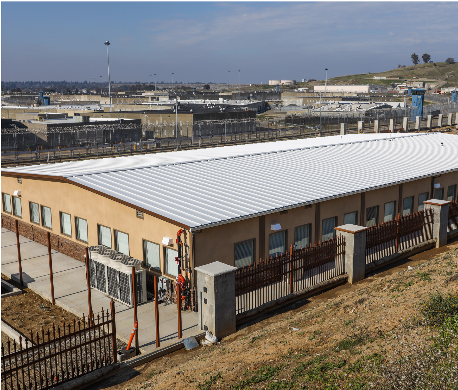
The MIS modular building at CALPIA's central office