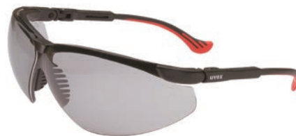
Shown in gray lens