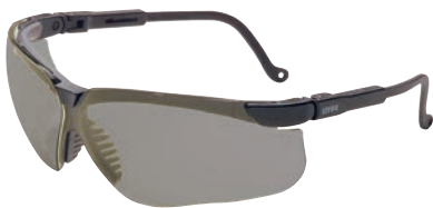
Shown in dark gray lens

Non-prescription Plano Safety Glasses can be ordered online at calpia.ca.gov